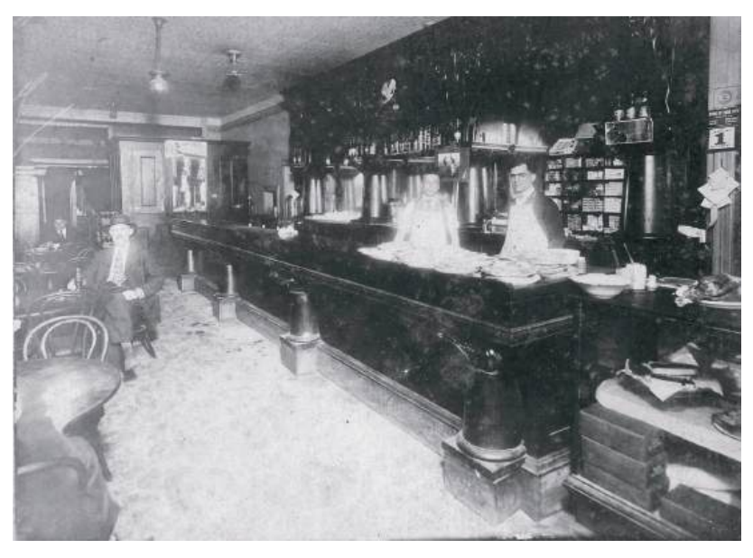
Casimiro Jr., on the right, serving Cuban Sandwiches and other specialties enjoyed by the local immigrants in the Café in 1919.

A trio of grilled skewers featuring fine cuts of marinated chicken, pork, Spanish chorizo and caramelized onions. A staple at bars and restaurants in Spain, perfect for sharing, 10